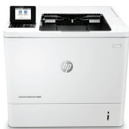
HP LaserJet Enterprise M608dn

This HP LaserJet Printer with JetIntelligence combines exceptional performance and energy efficiency with professional-quality documents right when you need them—all while protecting your network from attacks with the industry's deepest security. 1