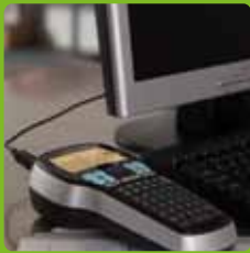
PC / Mac®