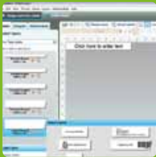
DYMO Label™ Software