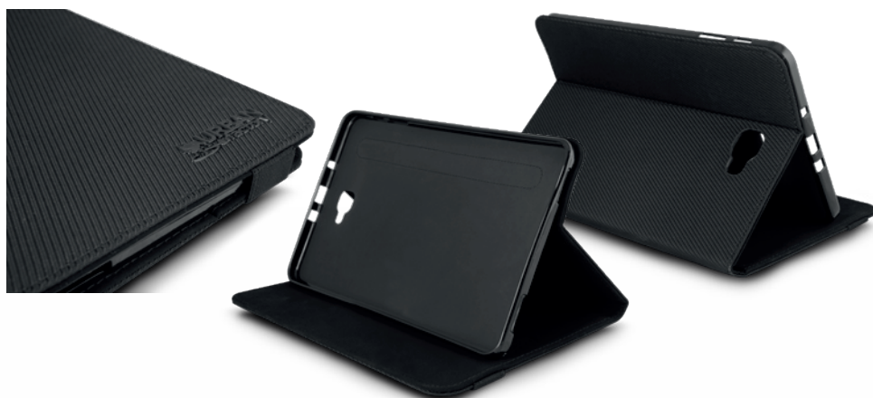
Matière extérieure déperlante Water drop outside fabric