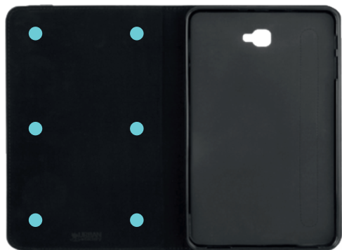
Parties magnétiques pour fixer un clavier Magnetic parts to fix a slim tablet keyboard