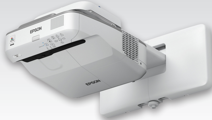
Optional wall mount not included.