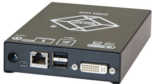
Compact Extender Twisted-Pair Receiver (ACX1R-11-C)