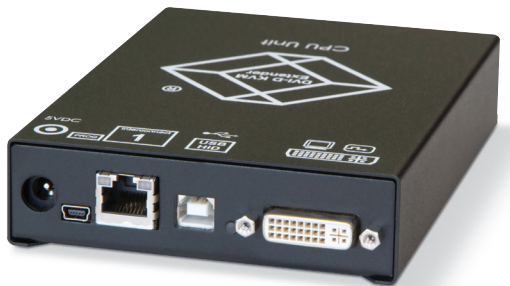
Compact Extender Twisted-Pair Transmitter (ACX1T-11-C)