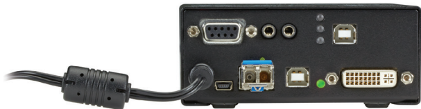
Compact Extender Fiber Transmitter (ACX1T-14AHS-SM)