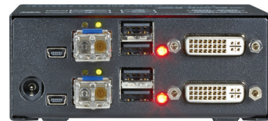
Compact Extender Fiber Receiver (ACX1R-22-SM)

NOTE: ACX1T-14AHS-SM must be used with ACX1R-14AHS-SM or the compatible modular extender at the receiver end of the link. Fiber receiver photo (ACX1R-14AHS-SM) is not shown.