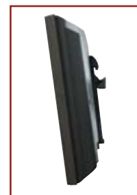
10° fixed tilt angle configuration