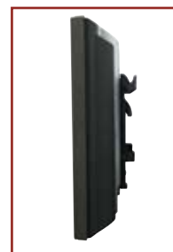
0° fixed tilt angle configuration