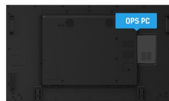
OPS PC SLOT

IPS technology offers higher contrast, darker blacks and much better viewing angles than standard TN technology. The screen will look good no matter what angle you look at it.