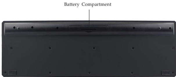
Figure 2: Rear Layout