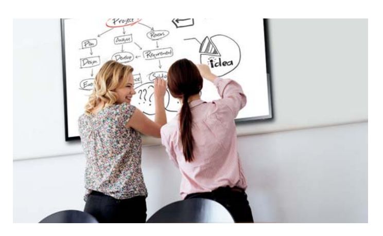
With the increased focus on teamwork and collaboration, Samsung interactive displays are also ideal for student meeting rooms in libraries, dorms and academic buildings. Students can use the interactive displays to collaborate on research projects, take notes, draw diagrams and share information.