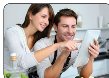
Check in on your baby using your smartphone or tablet