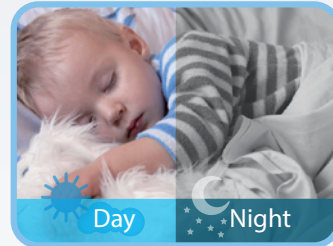
Day & night vision