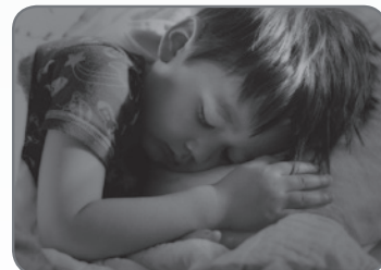
See up to 5m in the dark