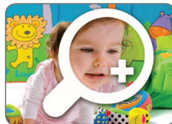
Digital zoom up to 4x from your mobile device