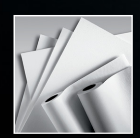
Handles photo and fine art papers, canvas and even thick medias