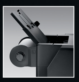
Roll paper capability for panoramas up to 44 inches long