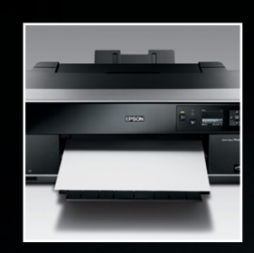
Advanced front-in, front-out media path provides a consistent, reliable paper feed