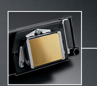
Advanced MicroPiezo® AMC™ Print Head A high-performance MicroPiezo print head precisely places variable sized droplets as small as 2 picoliters for intricate detail at resolutions up to 5760 x 1440 optimized dpi.