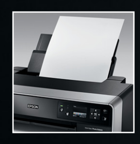
Auto sheet feeder holds up to 30 sheets of professional photo paper