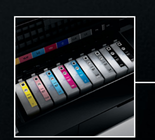
Epson UltraChrome K3<sup>®</sup> with Vivid Magenta Ink Technology

Epson UltraChrome K3 Ink technology ensures professional permanence ratings whether printing black-and-white or color. Reformulated magenta inks deliver an exceptionally wide color gamut and an expanded range of blues and violets.