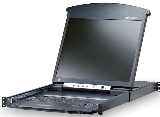
● KL1516Ai Front view