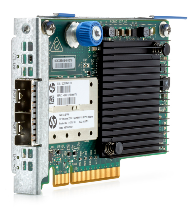
HPE Ethernet 10/25Gb 2-port 640FLR-SFP28Adapter

The HPE Ethernet 640FLR-SFP28 can provide up to 100Gbps of converged bi-directional Ethernet bandwidth, helping to alleviate network bottlenecks. This adapter can also run at 10 Gb for customers who have not changed the infrastructure/switches to 25 Gb vet.