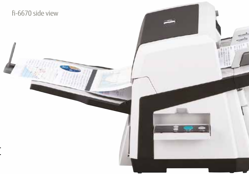
fi-6670 side view