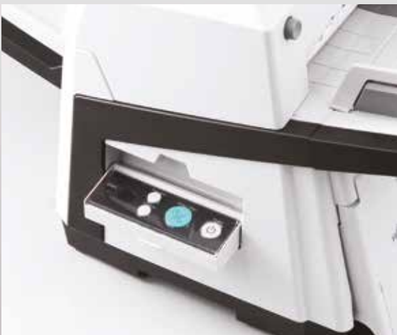
fi-6670 control console

Ultrasonic double-feed detection comes as standard with both models and this ensures that if sensors detect that a double feed is about to occur then the scanning process is stopped early. This helps to prevent the unintentional loss of information in scanned results and before any damage to the document occurs. Additionally advanced intelligence can be applied which enables the sensors to be set up to help identify and subsequently ignore attachments such as sticky notes or items with a photo attached that would otherwise cause disruptions to the scanning process.