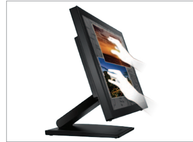
Integration of 10-point touch and projected capacitive touch technology provides accurate and precise touch experience