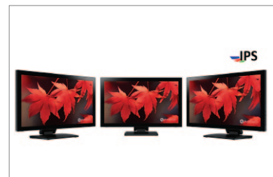
IPS panel provides superb clarity from all viewing angles