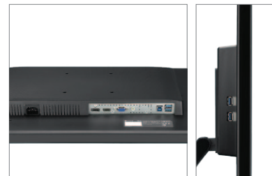
Versatile connectivity: VGA, HDMI, DisplayPort and USB port allow for effortless system integration