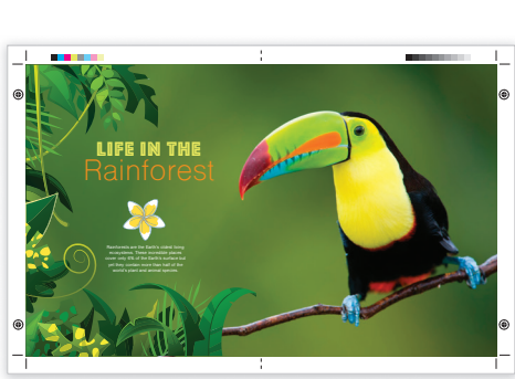
Oversize output for 11 x 17 bleed

With the Xerox® VersaLink® C9000 Color Printer, you can create finished pieces on a wide range of media to match the designer's intent.