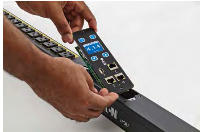
Module being removed without removing power to the ePDU

Eaton's new hot-swap eNMC (ePDU Network Management and Control) module can be replaced without the need to power down your rack. Increase uptime while enhancing serviceability and saving on unnecessary service calls. The menu-driven pixel display allows for easy setup and troubleshooting.