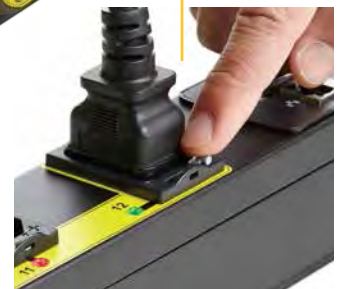
O is unlocked, + is grip engaged