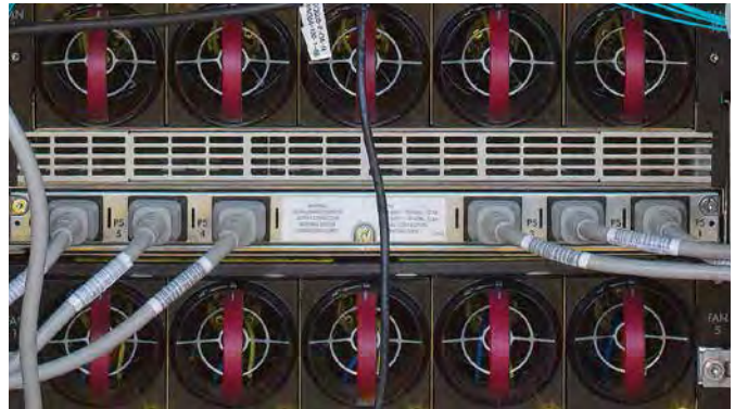
Typical server with multiple power inputs powered by two ePDUs

When connecting multiple source input servers to an A and B feed power source, the daisy-chain capability allows you to group power supplies across the ePDU. As a result, all the power supplies are controlled with a single action, which saves time rebooting servers with two to six power supplies.