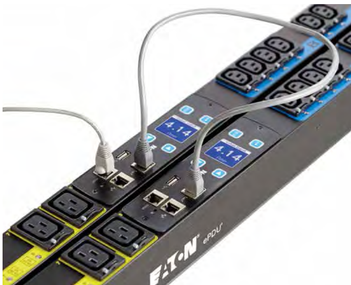
A and B power PDU sharing a network connection via daisy chain

Eaton's new patented daisy-chain capability allows up to eight ePDUs to share the same network connection and IP address. Unlike competitive rack PDUs that require a dedicated IP address for best performance, Eaton technology provides a 87.5 percent reduction in network infrastructure costs.