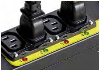
Green LED signifies power on and red is power off to outlet

Secure and protect your environment by easily turning off unused outlets. Avoid overloading your system from others plugging in unauthorized devices. Also consider closing access with an outlet cap.