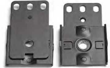
Eaton patented clip feet