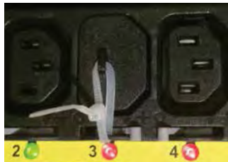
Cap secures in place with cable tie