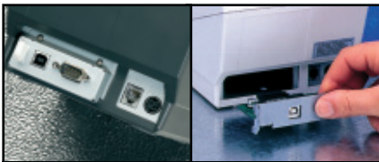
Serial, Parallel and USB interface versions are available, plus a non interface version for use with Ethernet or WiFi