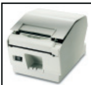
Flush fitting edges for new splash-resistant design