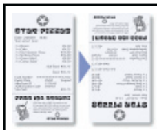
Receipt Rotation Tool