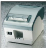
Splash Proof cover