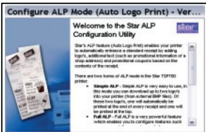
Easy-to-use AutoLogo™ graphics tool able to configure / download up to 15 coupons without any expensive software changes using a simple wizard-driven utility. Load & "ID" a graphic to then trigger a profit-making coupon etc.