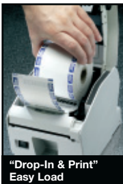
"Drop-In & Print" Easy Load