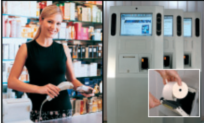
High speed, multi-functional printer, ideal for Labels, Barcodes, Receipts, Tickets and Kiosk