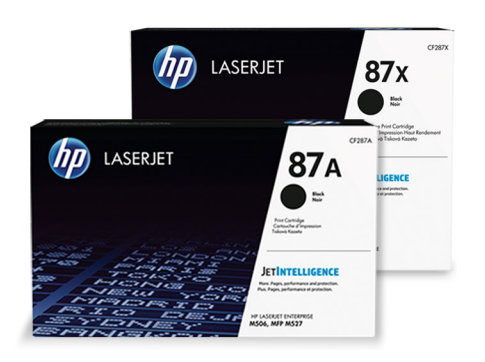
Original HP Toner cartridges with JetIntelligence

Bring out the best in your printer. Get exceptional print quality and help protect your device, using Original HP Toner cartridges with JetIntelligence. Help ensure you're getting the authentic HP quality you paid for with innovative anti-fraud technology.