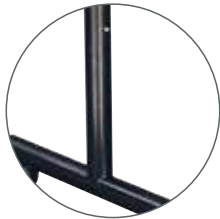
HEIGHT ADJUSTABLE LEGS