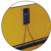
LOCKING FLIP LEVER