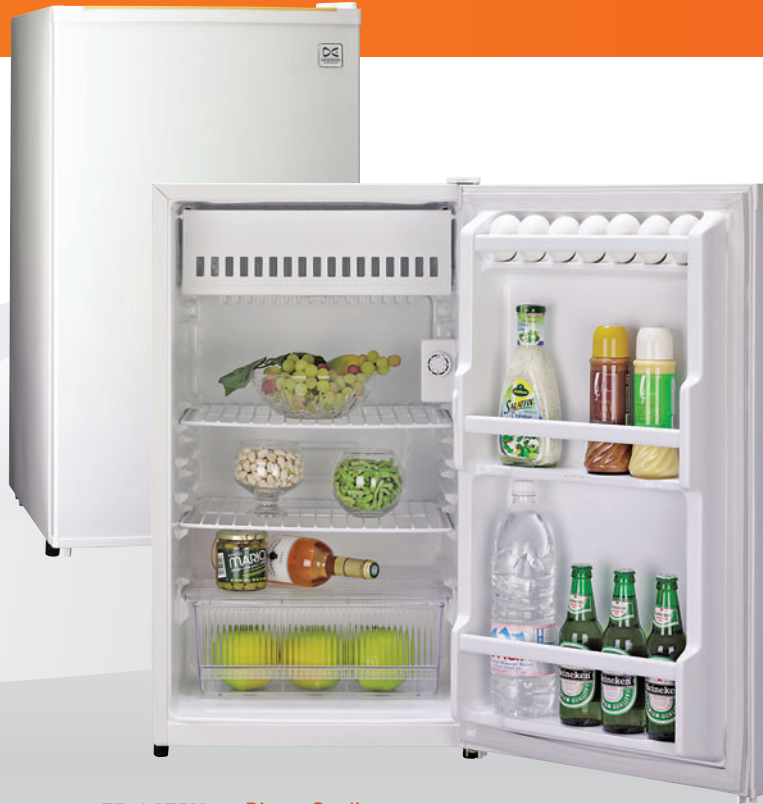
FR-147RV • Direct Cooling 129LT White • Reversible Door WxHxD (mm) 480x858x531