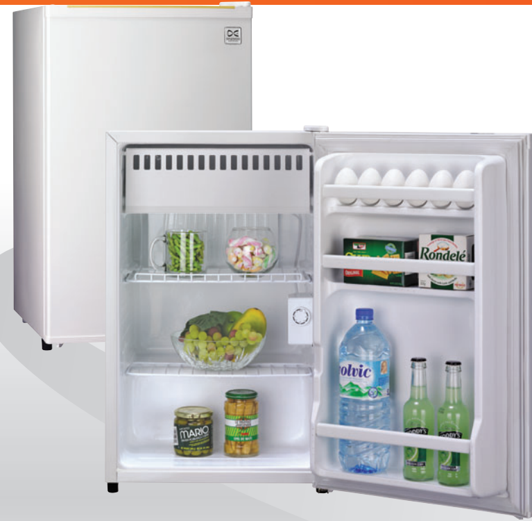
FR-094R • Direct Cooling 80LT White • Reversible Door WxHxD (mm) 440x726x452