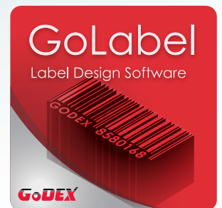
Free labeling software GoLabel for easy printing