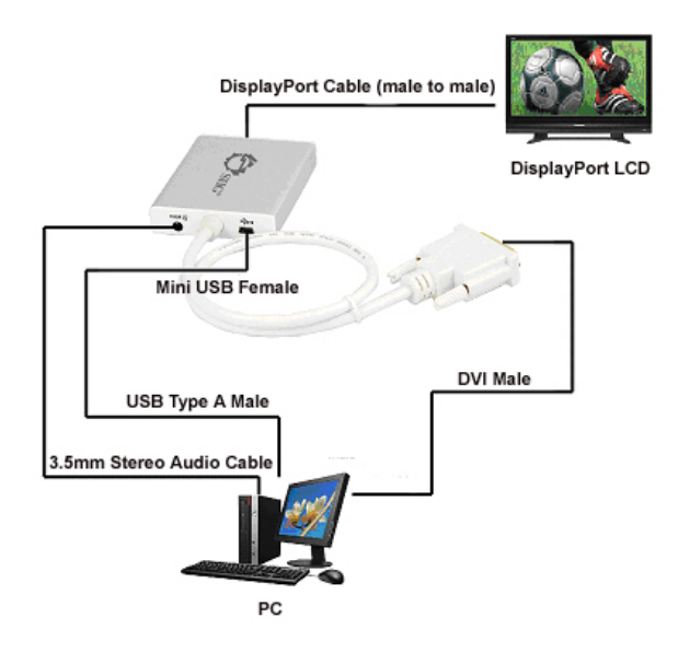
Figure 2: Application Diagram