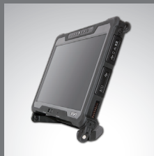
A140 with Multi-Function Hard Handle as Kickstand