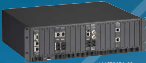
LMC5207A-R2 (with modules installed)