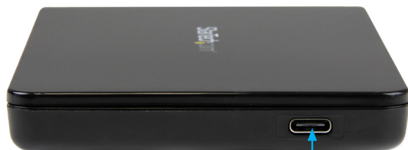
USB 3.1 port