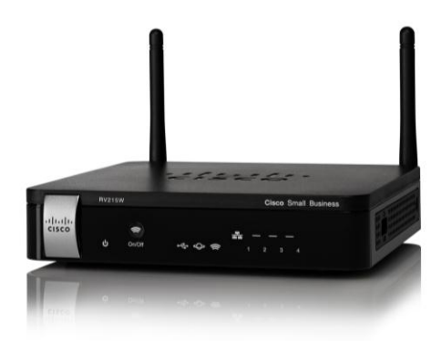
Figure 1. Cisco RV215W Wireless-N VPN Router

The Cisco® RV215W Wireless-N VPN Router provides simple, affordable, highly secure, business-class connectivity to the Internet from small and home offices and remote locations.