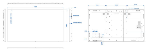
Philips 98BDL4150D www.philips.com