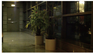
with Night Mode