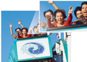
Without 1080p FHD

The M23 is packed with a 5x optical zoom, a 5MP CMOS sensor as well as a 3" touch screen display, and is also portable enough to shoot 1080p FHD video.