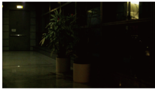
Without Night Mode

With the built-in LED torch and Night Mode function, the M23 is capable of clearly capturing video images at night. The night mode is designed to automatically set the right settings in low light situations, while the LED torch brightens subjects and can light up objects within 1 meter. It can illuminate any area, resulting in clear images in the dimmest of backgrounds.