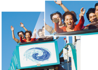
with 1080p FHD