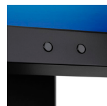
Ambient and human sensors