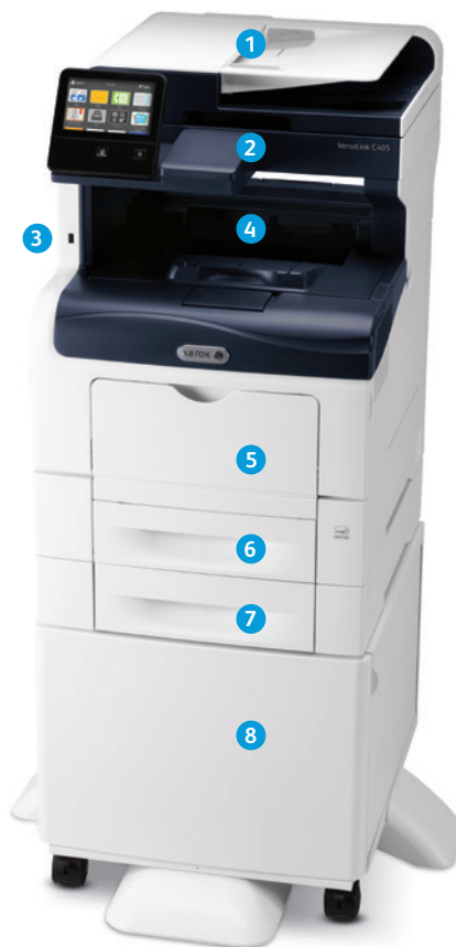
Xerox® VersaLink® C405 Color Multifunction Printer Print. Copy. Scan. Fax. Email.