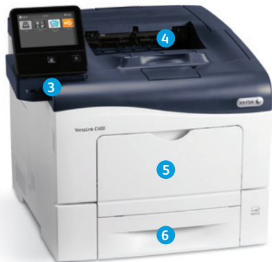
Xerox® VersaLink® C400 Color Printer Print.

2 USB ports can be disabled; 3 VersaLink C405 only.