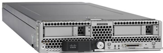
Figure 1. Cisco UCS B200 M4 Blade Server

In addition, Cisco UCS has the architectural advantage of not having to power and cool excess switches, NICs and HBAs in each blade server chassis. Having a larger power budget per blade server provides uncompromised expandability and capabilities, as in the new Cisco UCS B200 M4 server with its leading memory-slot and drive capacity.