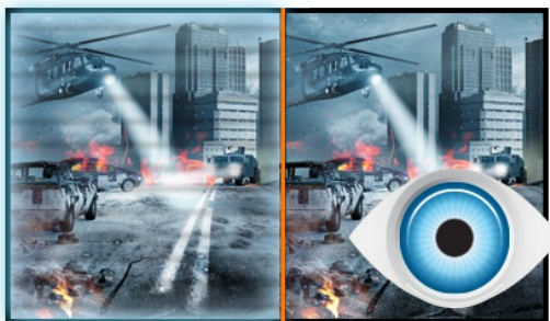
FLICKER FREE + BLUE LIGHT

Available also in black: ProLite B2791HSU-B1.