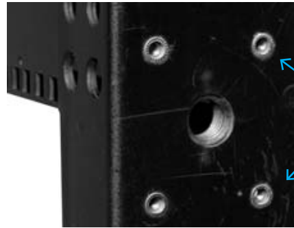
Optional Caster mounting point, on bottom of rack frame