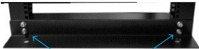
Hex Socket Screws