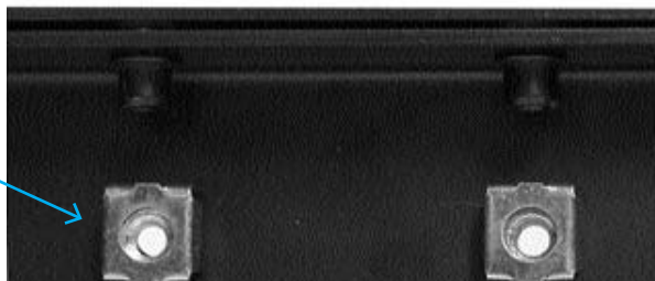
Pre-installed cage nuts

NOTE: When installing the arms, it might be easiest to start with the top arms for stability reasons.