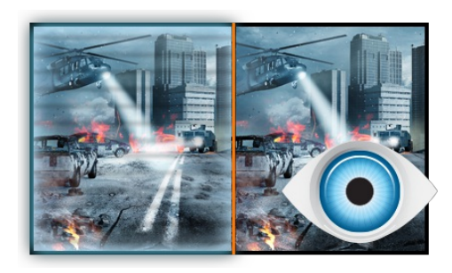
Flicker-free + Blue light

With true 1920 \times 1080p resolution your monitor is ready to display high definition images. This means you can accommodate more information on your screen; e.g. 60% more in comparison to a 1280 \times 1024 monitor.