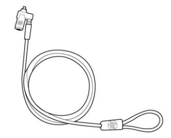
HP Keyed Cable Lock 10mm (T1A62AA)