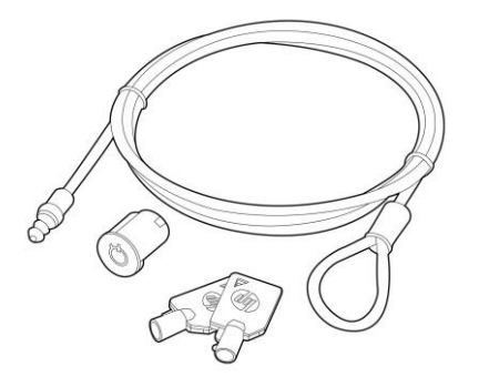
HP Docking Station Cable Lock (AU656AA) HP Master Keyed Docking Station Lock (AY474AA)