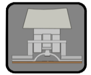
Membrane Key Switches