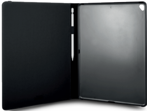
Porte Stylet Pencil Holder