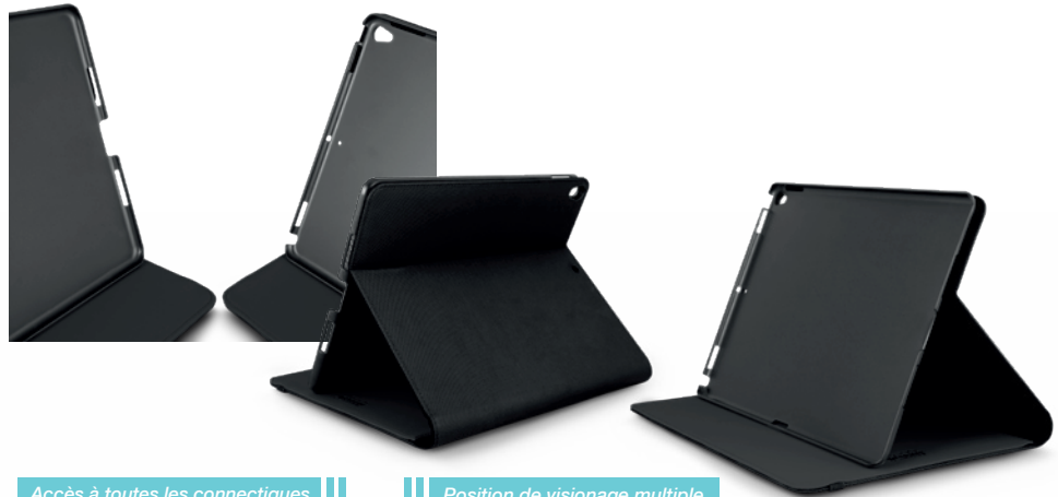
Accès à toutes les connectiques Full connectors access