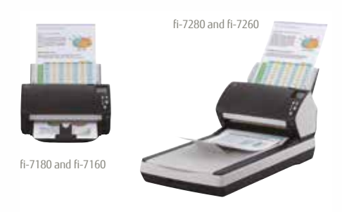
fi-7160 / fi-7260 – A4 Portrait at 300 dpi 60 ppm / 120 ipm fi-7180 / fi-7280 – A4 Portrait at 300 dpi 80 ppm / 160 ipm Scan mixed batches through the 80 sheet ADF