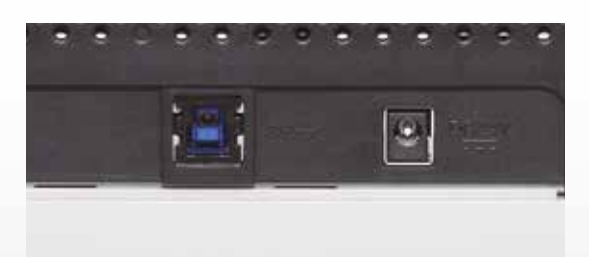
High speed performance through USB 3.0 interface