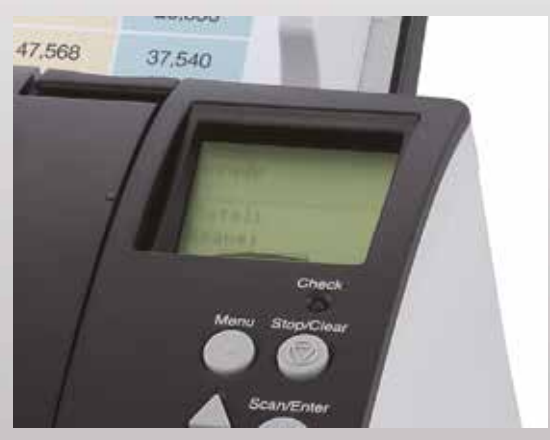
Integrated LCD operating panel

These are the first desktop scanners in the World equipped with iSOP (Intelligent Sonic Paper Protection); which detects changes in the acoustic noise generated by paper and enhances the paper feeding process. Additionally they feature innovatively developed hardware and software to help augment your daily routines and boost your organisation's efficiency.