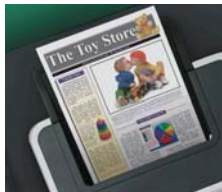
Print complex documents quickly with comprehensive printer language support