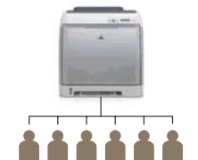
Enhance your office productivity with built-in Fast Ethernet networking