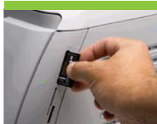
Add photos easily to your documents with built-in memory card slots 2