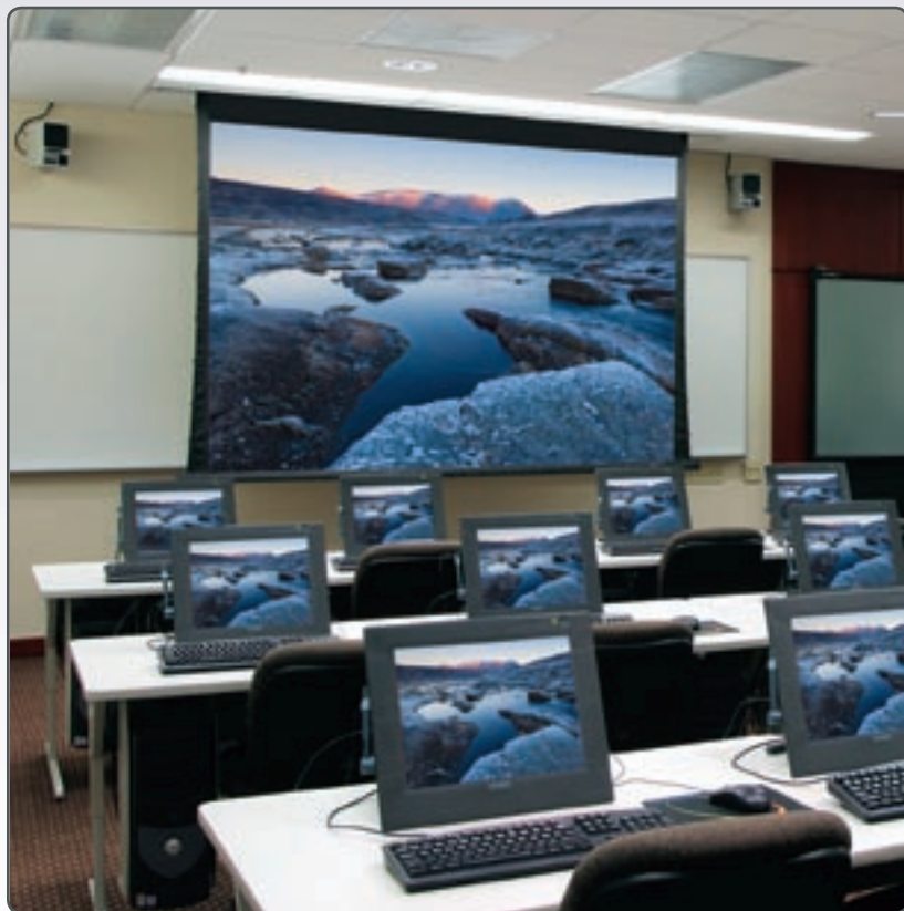
DePauw University, Greencastle, IN.

PERFECTLY FLAT VIEWING SURFACE DELIVERS PERFECT IMAGE CLARITY