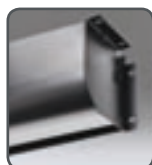
Large style Premier case