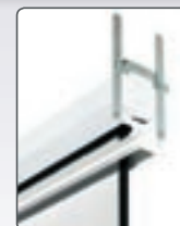
Ceiling Opening Trim kit on a Targa projection screen.

With the Draper Ceiling Trim Kit, the slot is always exactly the right size and in precisely the right location. Our finished slot is always flush, square, attractive and the same length as the screen case.