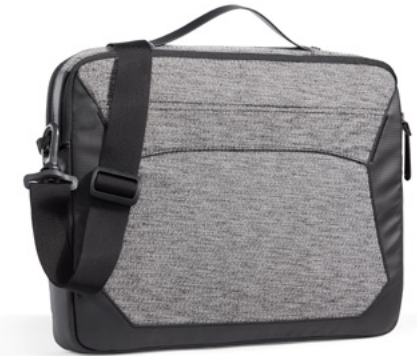
removable shoulder strap