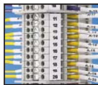
Terminal Block Labeling