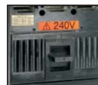
Electrical Hazard Labels