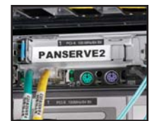
Network Infrastructure Labeling