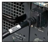
Electrical Infrastructure Labeling