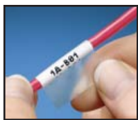
Wire and Cable Marking