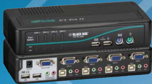
KV7021A: top: front view; bottom: rear view