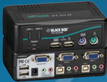
KV7020A: top: front view; bottom: rear view