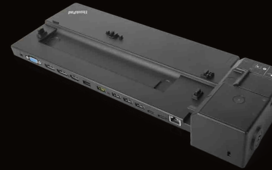
ThinkPad Ultra ▶ Dock (135W)