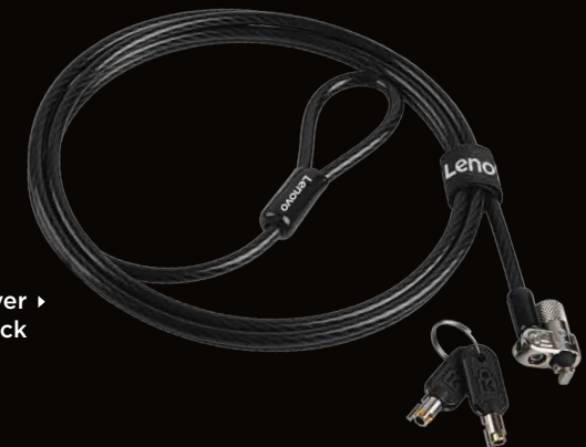
Kensington MicroSaver ▶ 2.0 Cable Lock