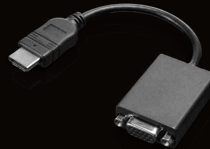
◀ Lenovo HDMI to VGA Adapter Cable