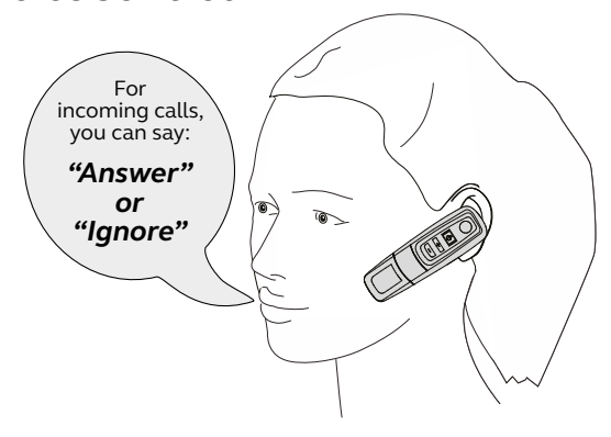
Tap the Parrott Button<sup>TM</sup> and say "What can I say?" for a list of voice commands.