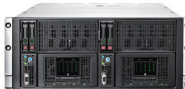
HPE ProLiant SL4500 (2 server nodes in 4.3U Chassis)