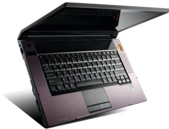
Lenovo IdeaPad Y530