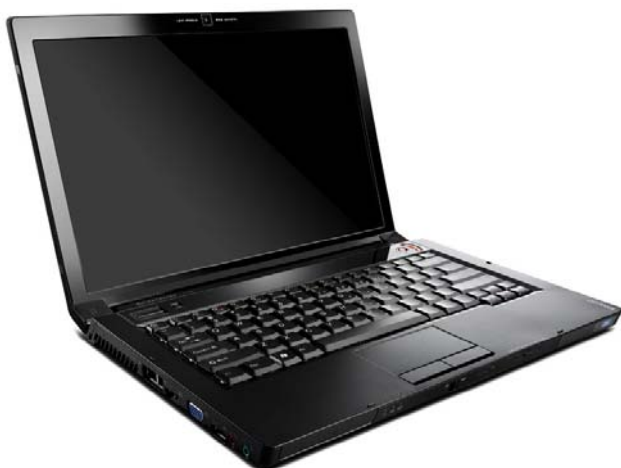
Lenovo IdeaPad Y430