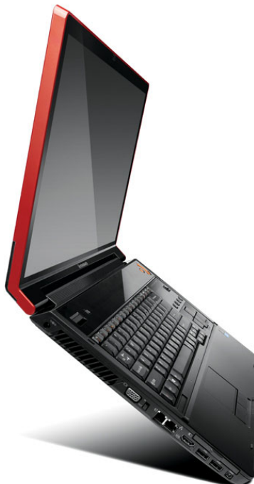
Lenovo IdeaPad Y730 Valencia Orange