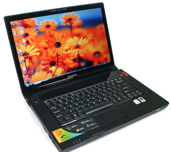
Lenovo IdeaPad Y510