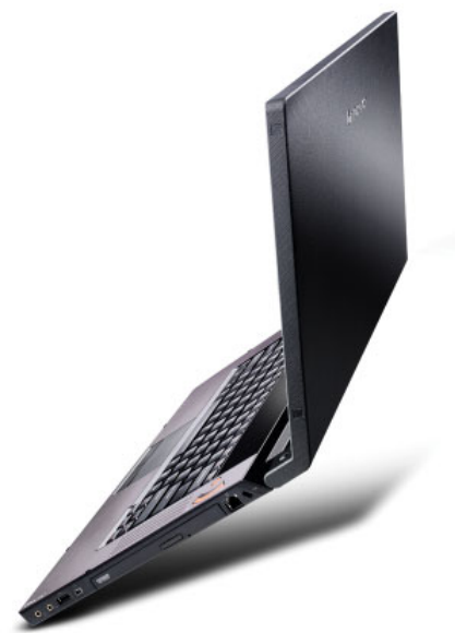
Lenovo IdeaPad Y530