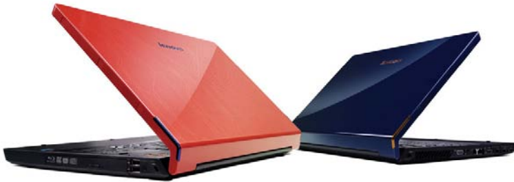
Lenovo IdeaPad Y730