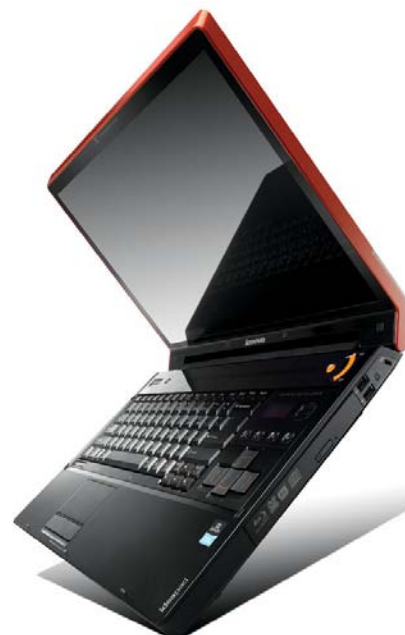
Lenovo IdeaPad Y730 Valencia Orange