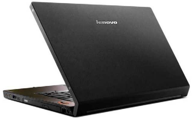
Lenovo IdeaPad Y530