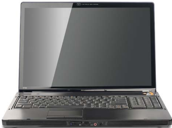
Lenovo IdeaPad Y710