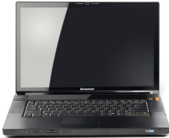
Lenovo IdeaPad Y510