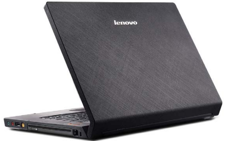
Lenovo IdeaPad Y510 with aluminum palm rest