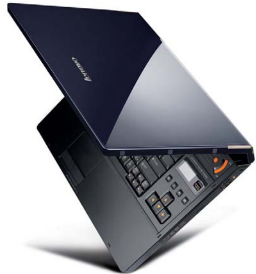
Lenovo IdeaPad Y710 (Game Zone on select models)