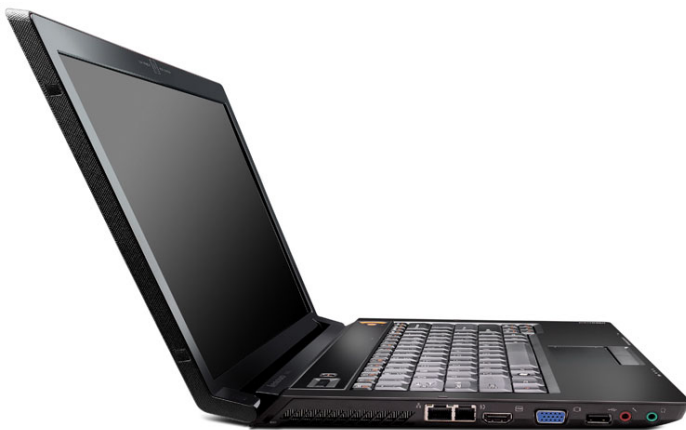
Lenovo IdeaPad Y430