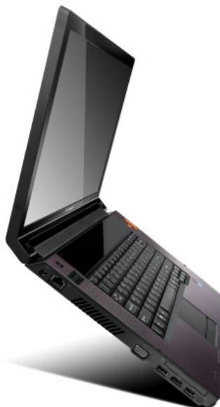
Lenovo IdeaPad Y530