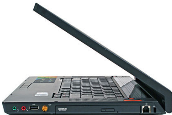
Lenovo IdeaPad Y510