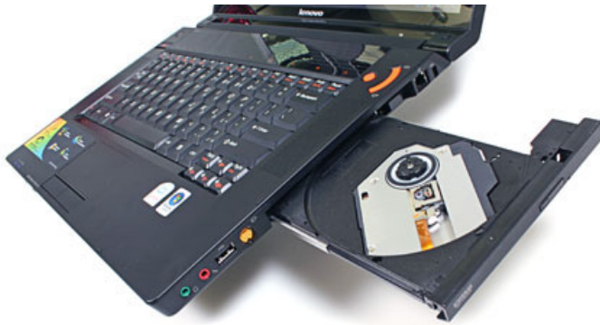
Lenovo IdeaPad Y510