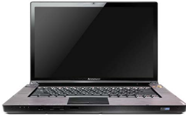
Lenovo IdeaPad Y530