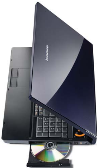
Lenovo IdeaPad Y710