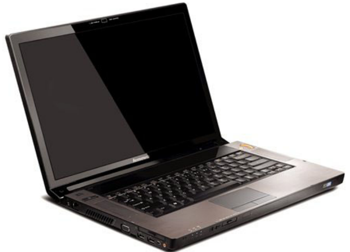
Lenovo IdeaPad Y510 with aluminum palm rest