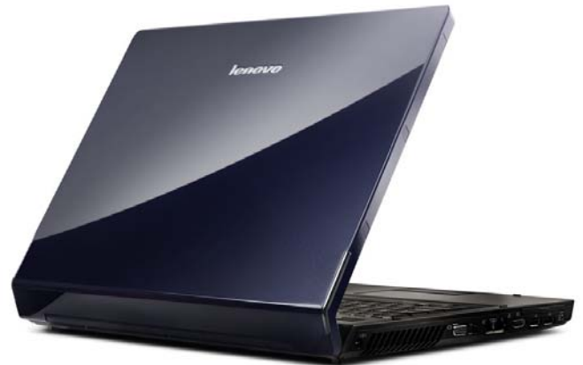
Lenovo IdeaPad Y710