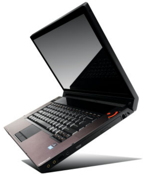
Lenovo IdeaPad Y530