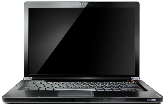
Lenovo IdeaPad Y430