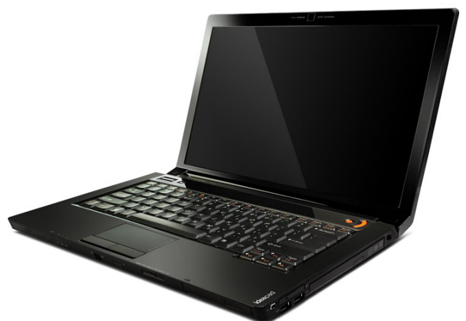
Lenovo IdeaPad Y430