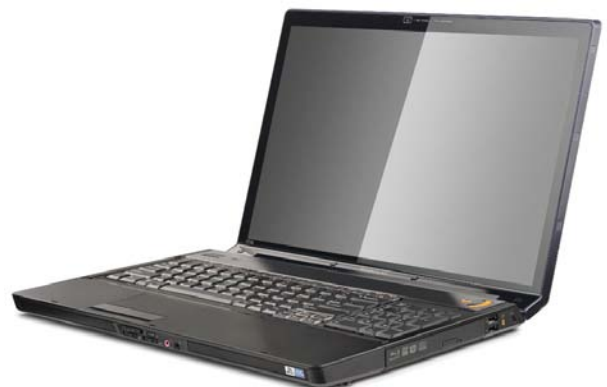
Lenovo IdeaPad Y710