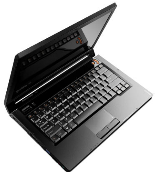
Lenovo IdeaPad Y430