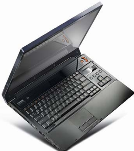
Lenovo IdeaPad Y710 (Game Zone on select models)