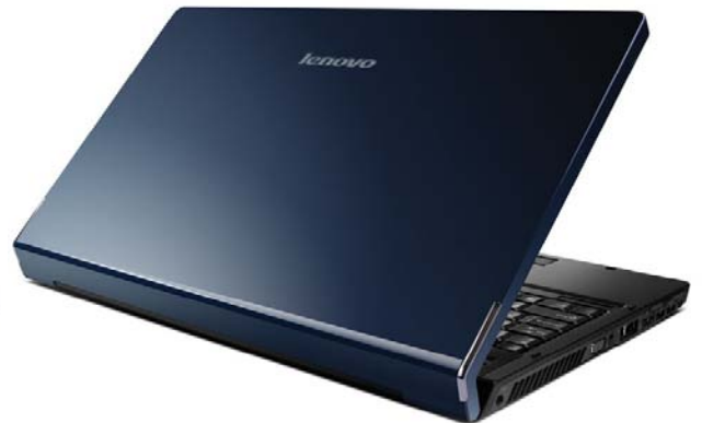
Lenovo IdeaPad Y730 Dark Blue, Glossy Finish