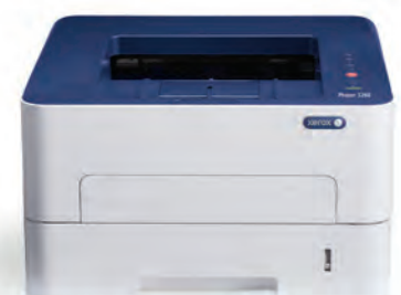
Phaser 3260. Print.