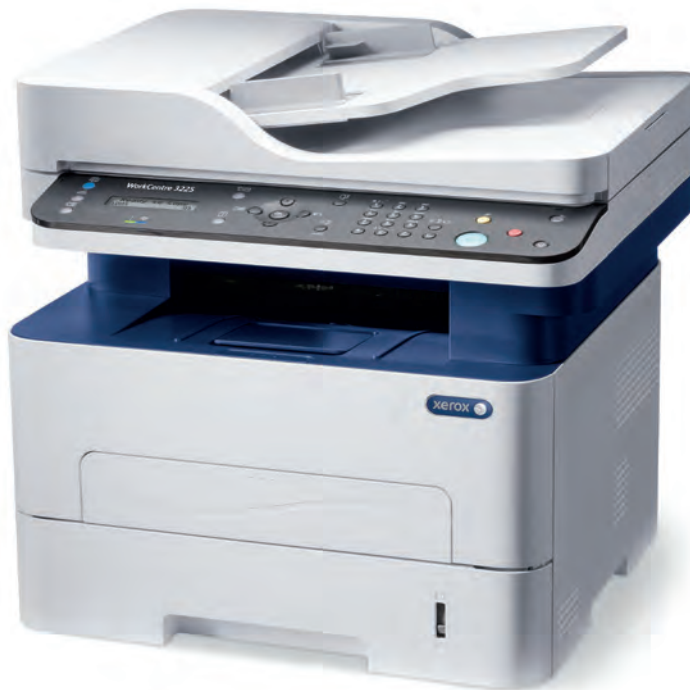
WorkCentre 3225. Copy. Print. Scan. Fax. Email.