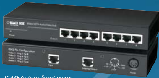
IC445A: top: front view; bottom: rear view